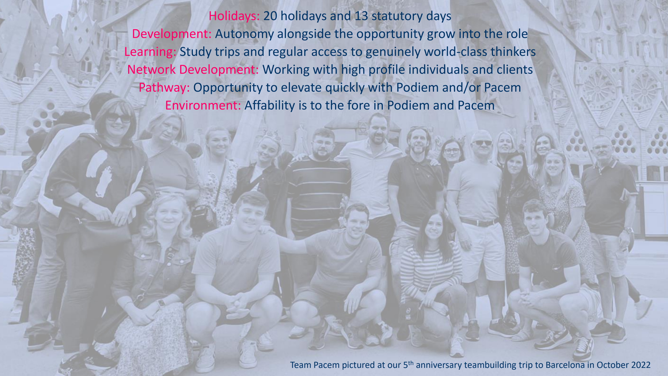
Team Pacem pictured at our 5 th anniversary teambuilding trip to Barcelona in October 2022

Environment: Affability is to the fore in Podiem and Pacem